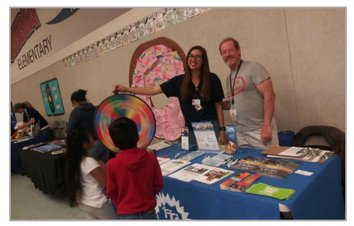
Community and school outreach event to disseminate SUD prevention information and promote community health and wellness.

➤ SPA 1 prevention contractors from Pueblo y Salud engaged with local officials in discussions about the high rates of opioid and benzodiazepine prescriptions written in Antelope Valley and the consequent high rates of emergency room visits from opioid overdoses in the area. This effort led to the creation of an opioid taskforce in the state legislature to address the opioid-related harms.