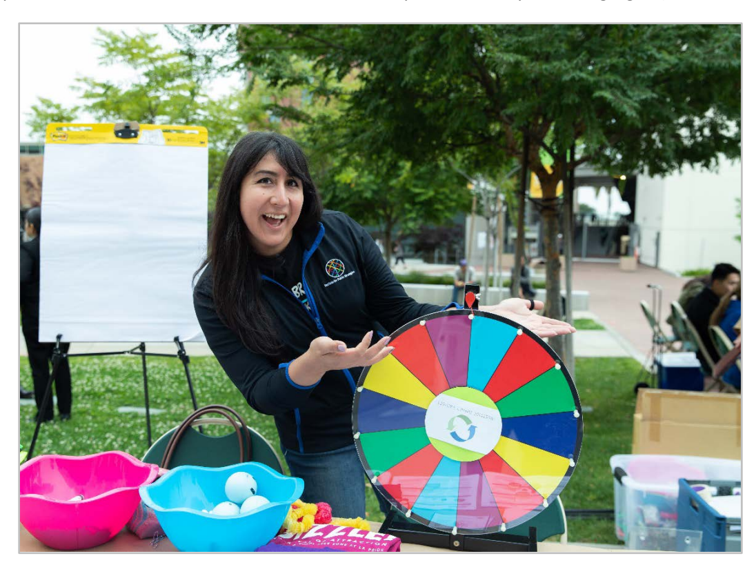
Community prevention provider from the Institute of Public Strategies.