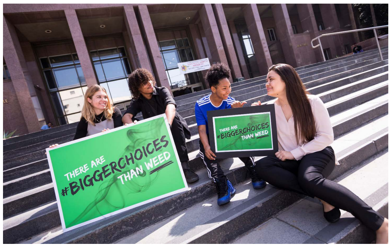
Marijuana use prevention media campaign: #BiggerChoices Than Weed.