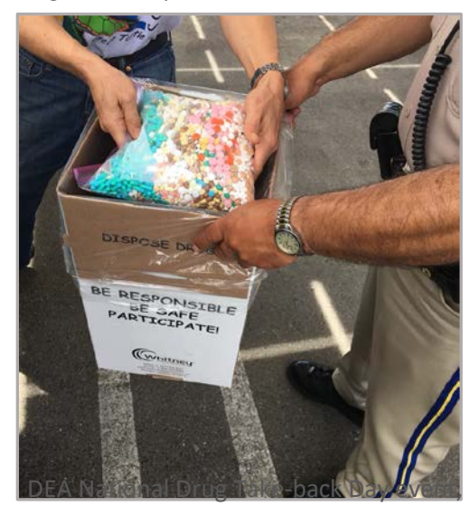
in collaboration with law enforcement.

➤ SPA 1 prevention contractors from Pueblo y Salud engaged with local officials in discussions about the high rates of opioid and benzodiazepine prescriptions written in Antelope Valley and the consequent high rates of emergency room visits from opioid overdoses in the area. This effort led to the creation of an opioid taskforce in the state legislature to address the opioid-related harms.