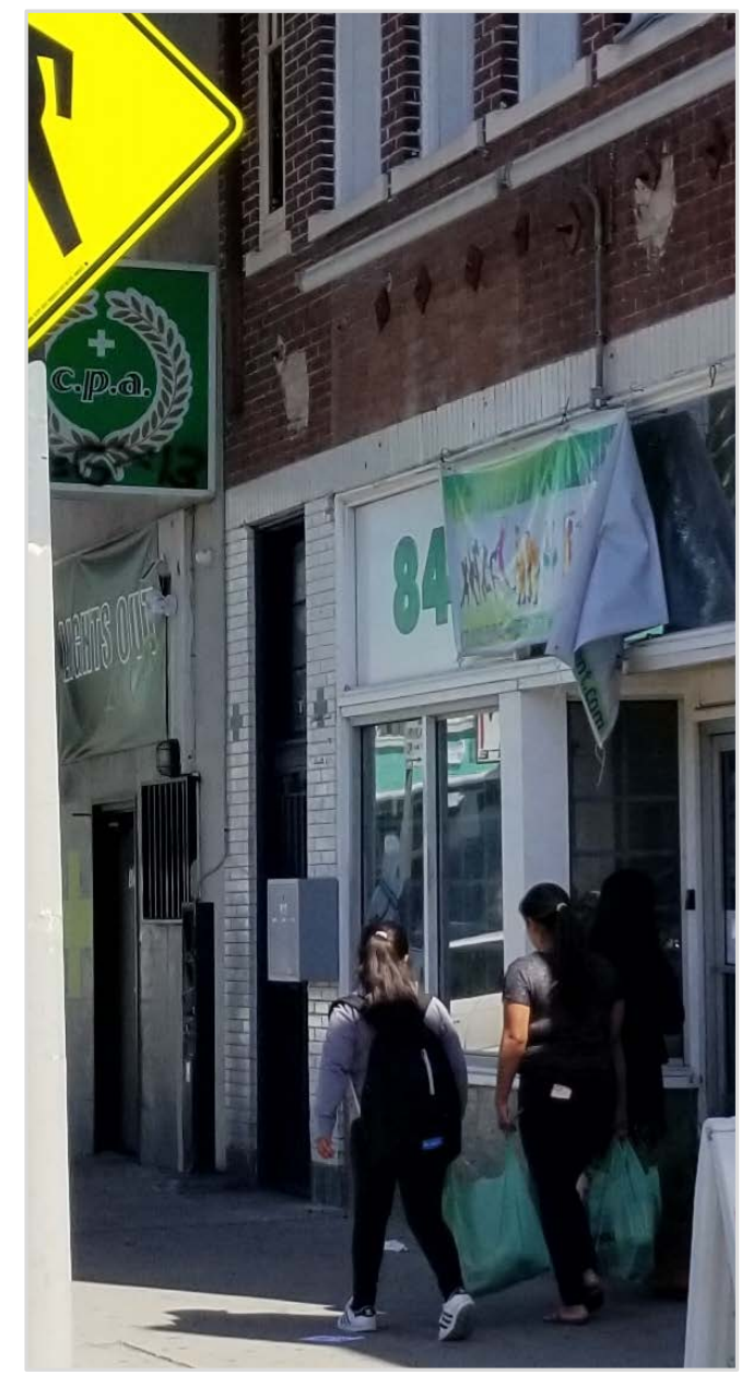
Two middle school aged girls walking past the c.p.a. marijuana shop.

Providers from all eight SPAs participated in Rethinking Access to Marijuana (RAM) Workgroup meetings to actively work toward reducing marijuana access and use by L.A. County youth. The workgroup's four committees (media, research, policy, and education) were chaired by staff from SPAs 2, 4, 5, and 7.