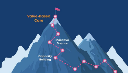
Table 1: Incentive Metrics – The following is a description of available incentive metrics efforts.